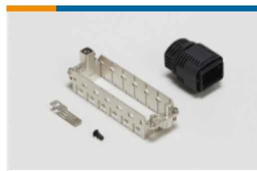
Rectangular Connector Hardware(13)